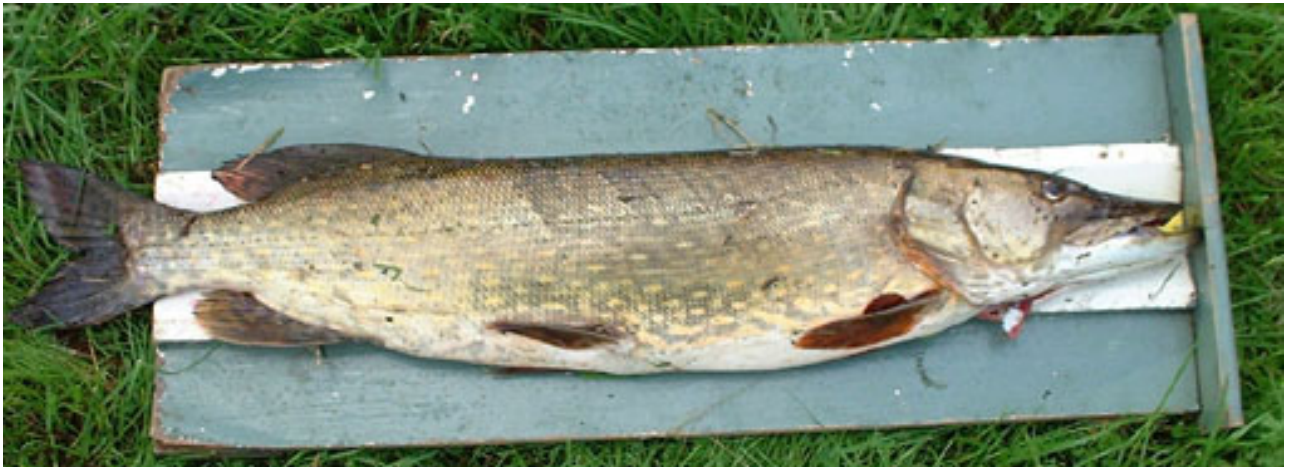
Photo C.4.1 : A Pike caught in St. Mary's Loch on the 29th May 2002

Though the Family Esocidae is distributed throughout most of Europe and the more temperate areas of Asia and North America it has just five species, only one of which is found in Europe. The European Pike is a fish of still and slow flowing waters and is designed to eat fish – its teeth are backward pointing which makes the escape of prey all but impossible. The body form, with the dorsal and anal fins set back near the tail is also designed for seizing prey fish, as this gives an ability to make very fast, short rushes from ambush. Spawning is in Spring, when water temperatures are between 4°C and 11°C and may be preceded by long migrations to suitable spawning areas. Males arrive at the grounds first, selecting shallow areas of thick vegetation in which to wait for females. The eggs are sticky and so adhere to the weed: Hatching takes from 10 to 30 days, depending on water temperature and the young grow rapidly, sometimes reaching 4cms after just one month. At a year old, they are 8 to 10cms in length and are already eating small fish. Females generally mature later and can reach much larger sizes than males, and may become important predators of smaller Pike in their waters.