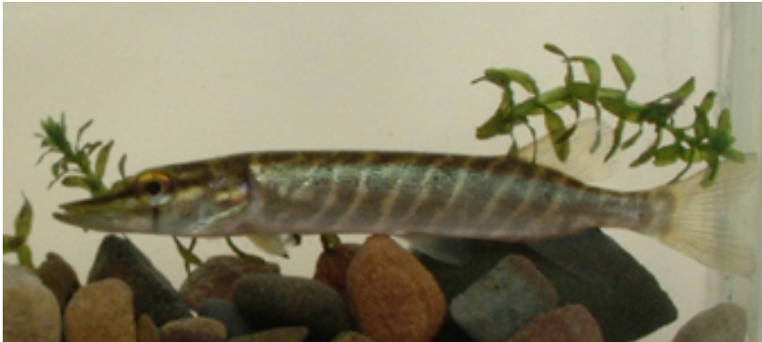
Photo C.4.2: A Pike Fry electric-fished from the outflow of the Shaws Loch, in the Ale Water catchment.

Unlike most other freshwater species other than Salmonids, Pike will feed at low water temperatures, even down to near zero. Where prey fish are in short supply, Pike populations can become largely cannibalistic, with a few very large, generally female fish feeding on a much larger population of small, young, Pike which feed on invertebrates. Frogs, Toads, Water Voles, Rats and Water Shrews are all eaten by larger Pike and they are a significant predator of young water birds. Trout are a preferred prey of Pike and larger individuals compete directly with anglers for trout of catchable size and they are known to have a significant impact on Salmon smolts when these have to pass through lochs and rivers that have Pike populations.