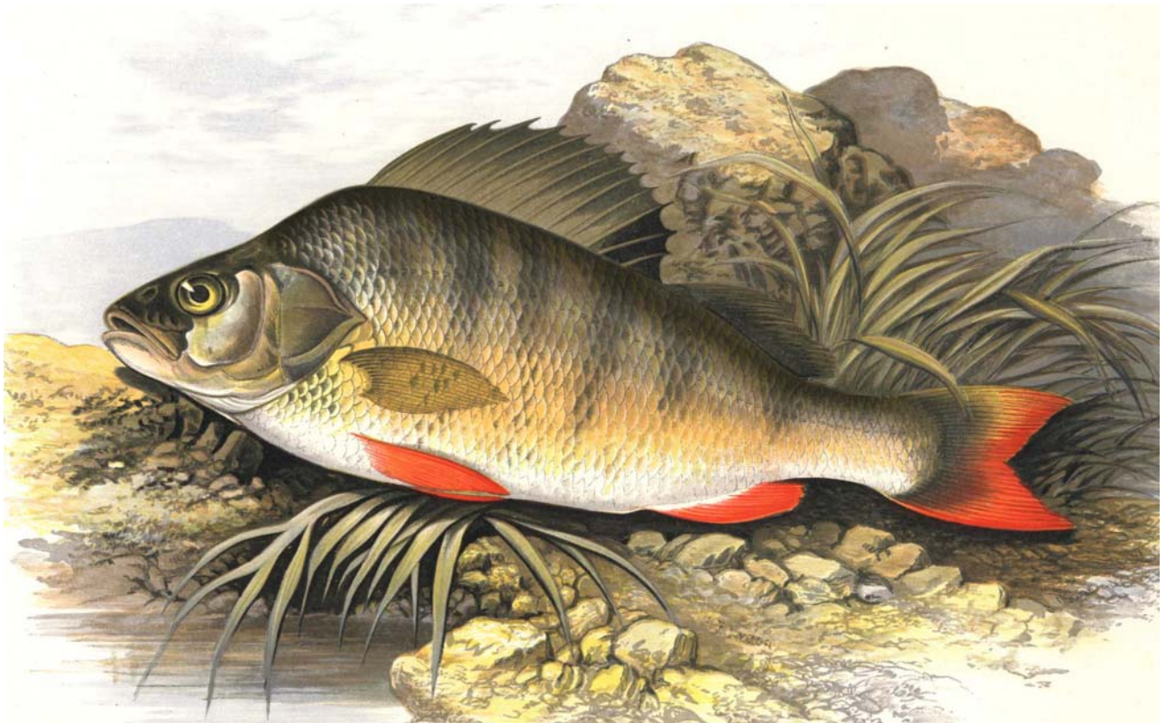
Photo C.3.1 : The Perch, taken from British Freshwater Fishes, by the Rev. W. Houghton, illustrated by A.F. Lydon, 1879

The Percidae (the Perch family) contains 16 species, spread across northern Europe, Asia and America: 12 species can be found in Europe. Two are native to the south of England, the Perch and the Ruffe, and a third, the Pikeperch or Zander was introduced in 1878 and again in 1910 and has now spread around eastern England. Perches are predatory fishes and the larger species can work as groups, rounding up shoals of small fishes to eat.